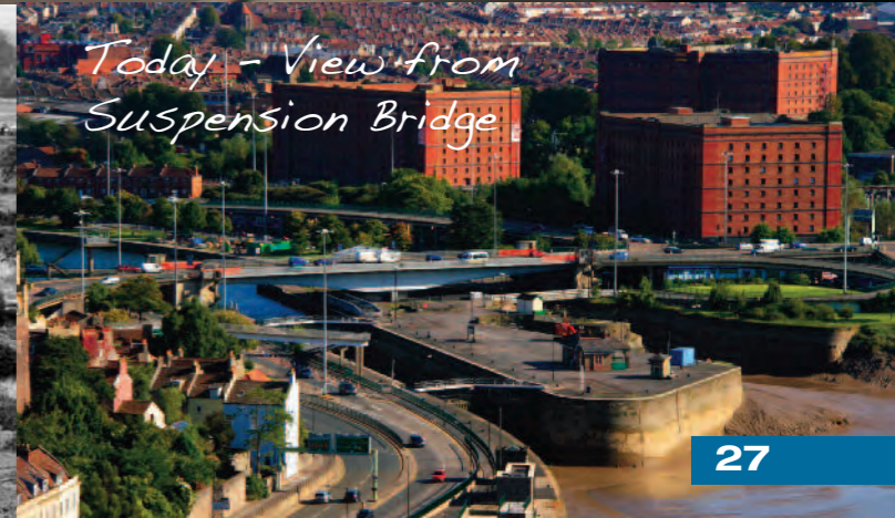
Today - View from Suspension Bridge